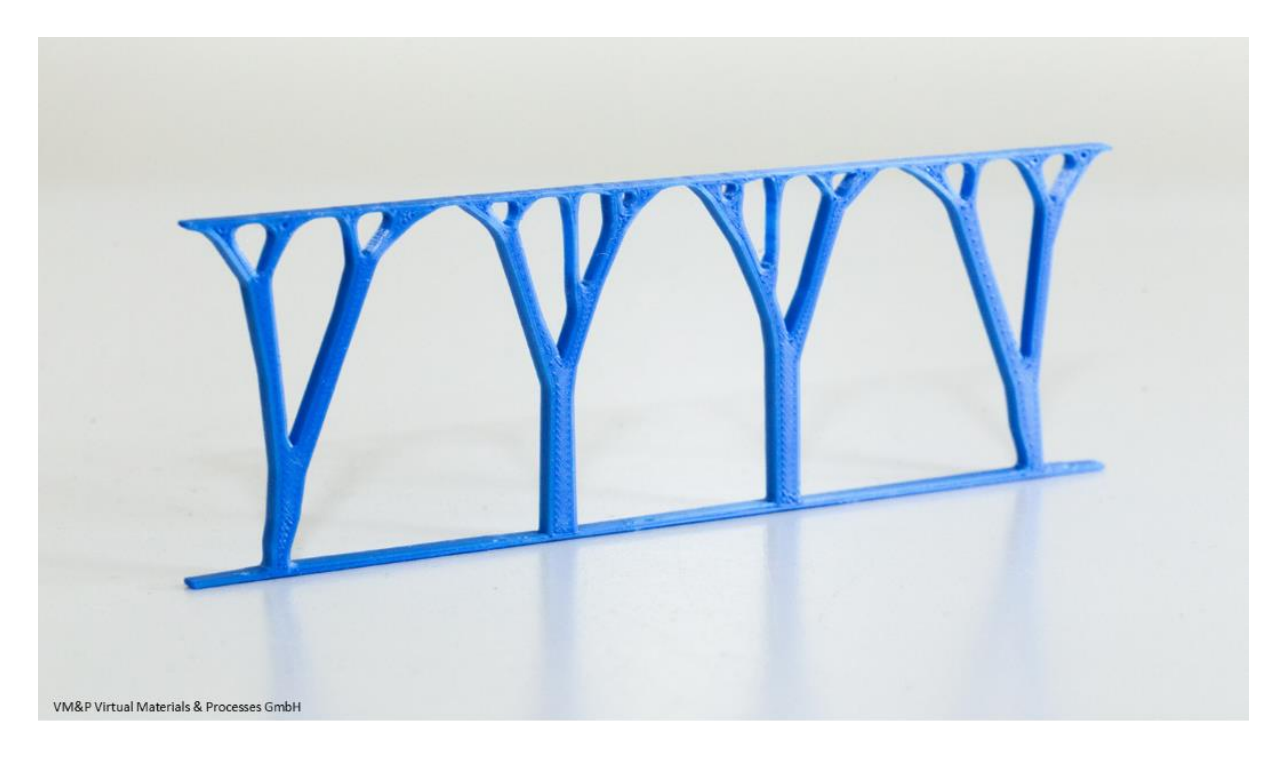
3D print of the optimized structure

Need to improve your design? We are pleased to support you in geometry optimization with our experience. Do not hesitate to contact us: <a href="mailto:info@vm-p-gmbh.com">info@vm-p-gmbh.com</a>